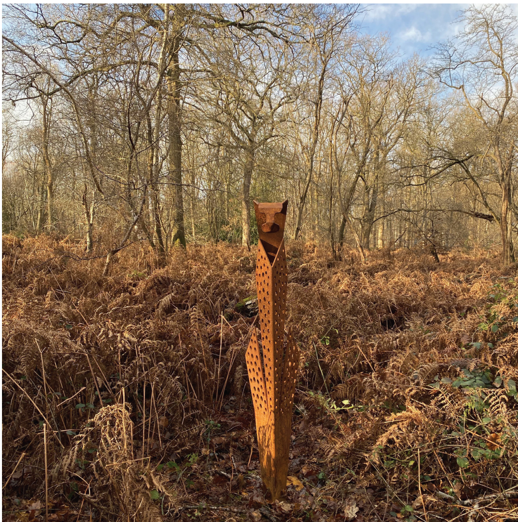
Cheetah Light 180 x 42 x 36 cm Corten steel with integrated lighting