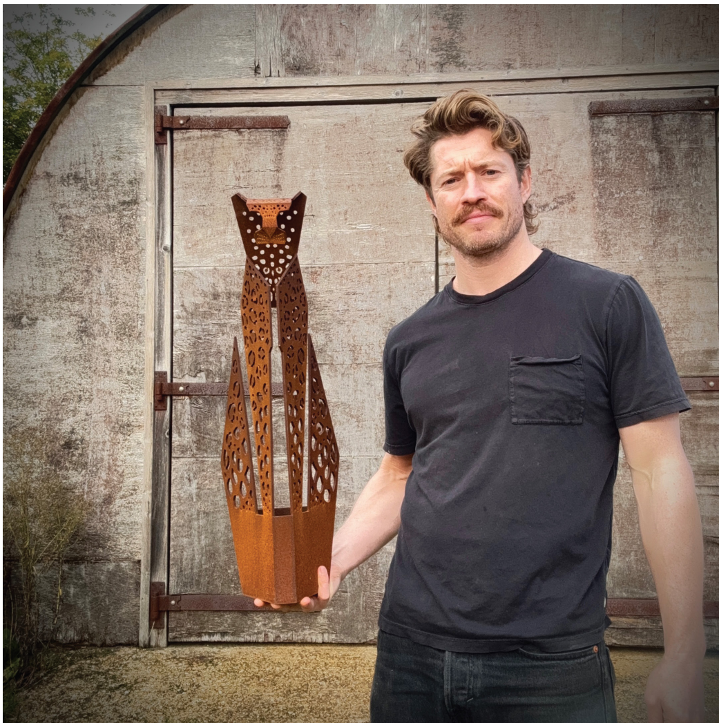
Leopard Light Small 62.5 x 22.5 x 27.5 cm Corten Steel with integrated lighting