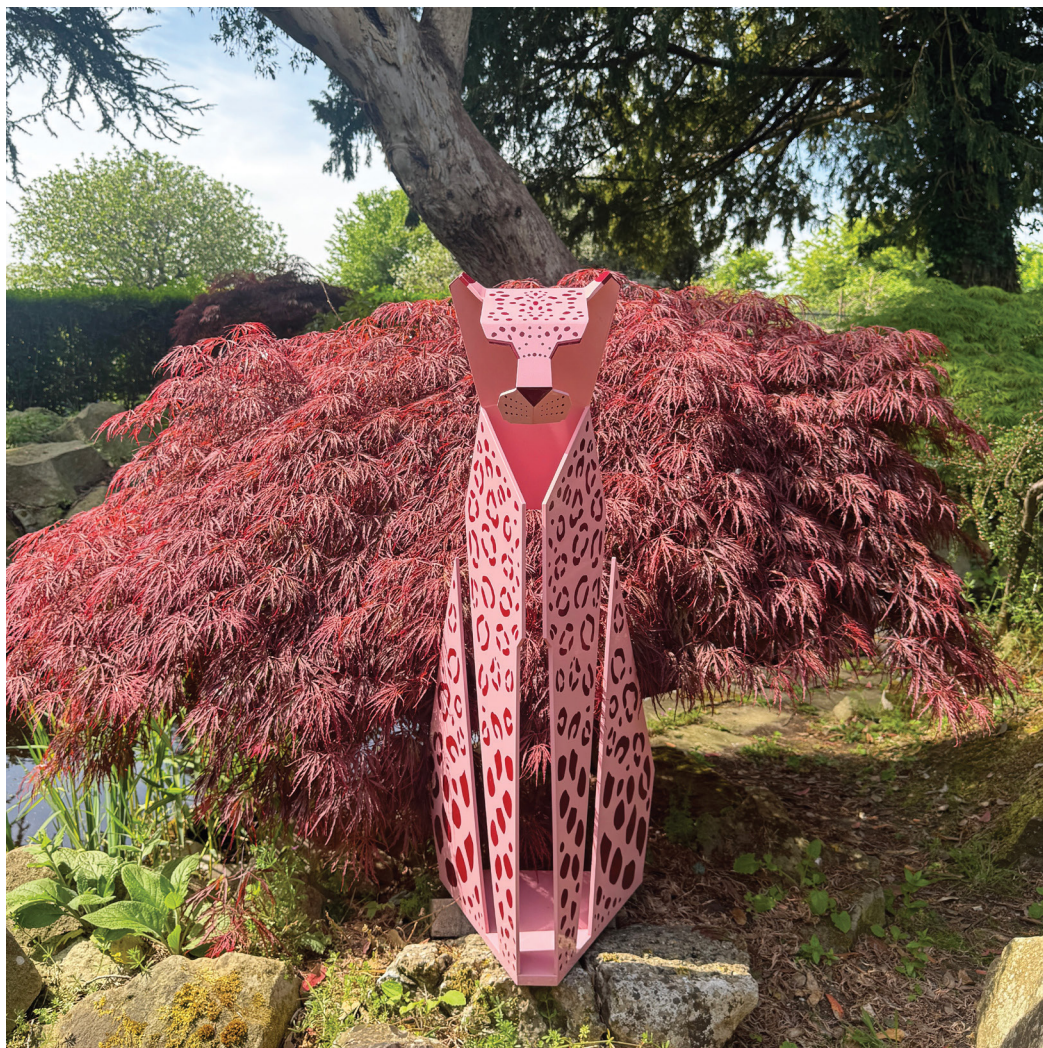
Leopard (Pink with Rose spots)