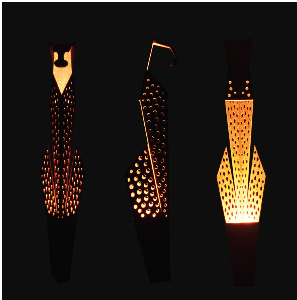
Cheetah Light (illuminated) 180 x 42 x 36 cm Corten steel with integrated lighting