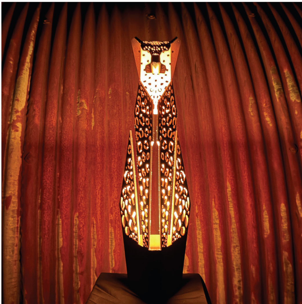
Leopard Light (illuminated) Small 62.5 x 22.5 x 27.5 cm Corten Steel with integrated lighting