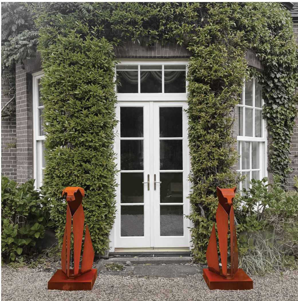
Dog Light & Cat Light 115 x 50 x 50 cm Corten steel with integrated light