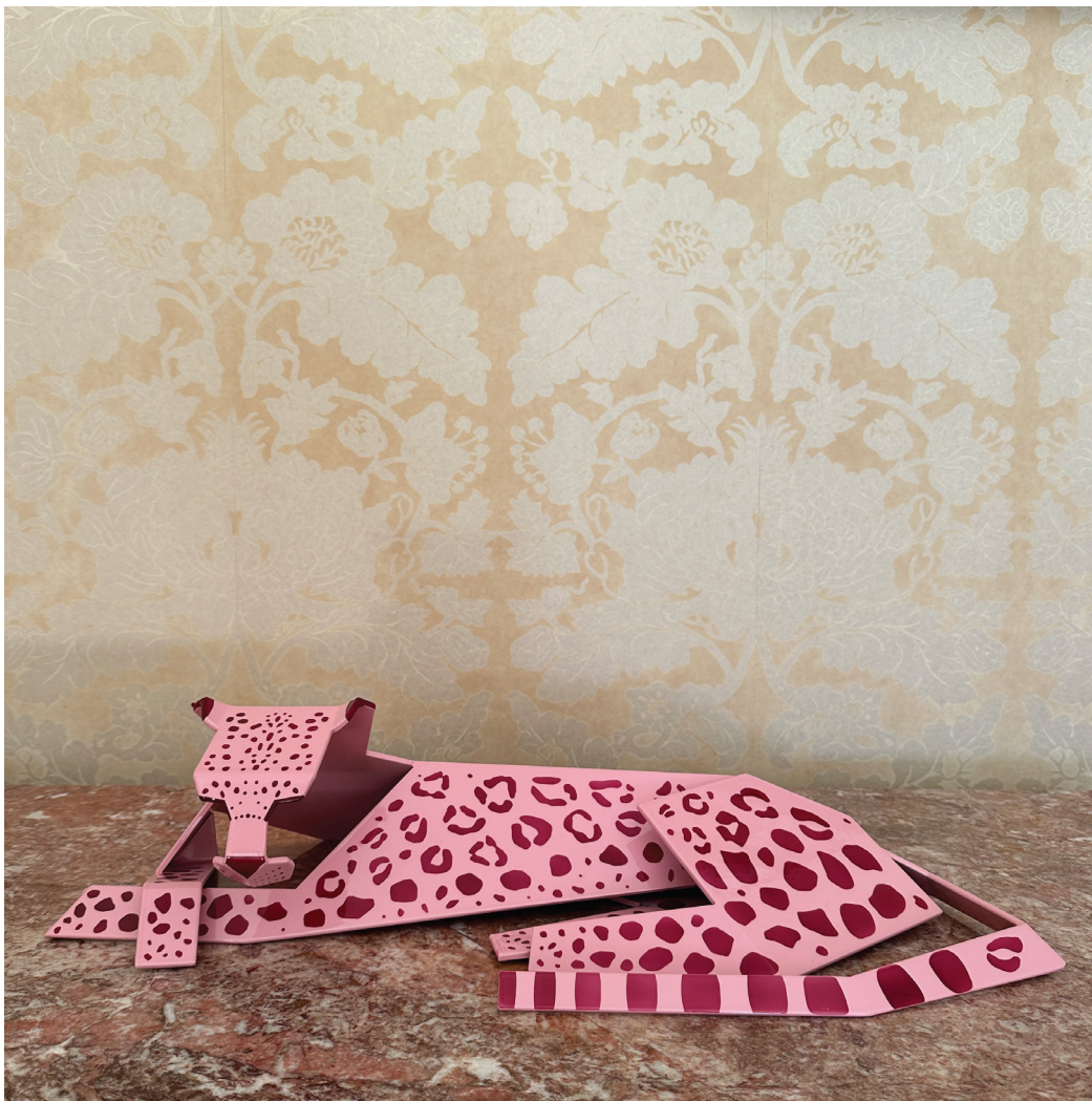
Lying Leopard (Pink with Rose spots)