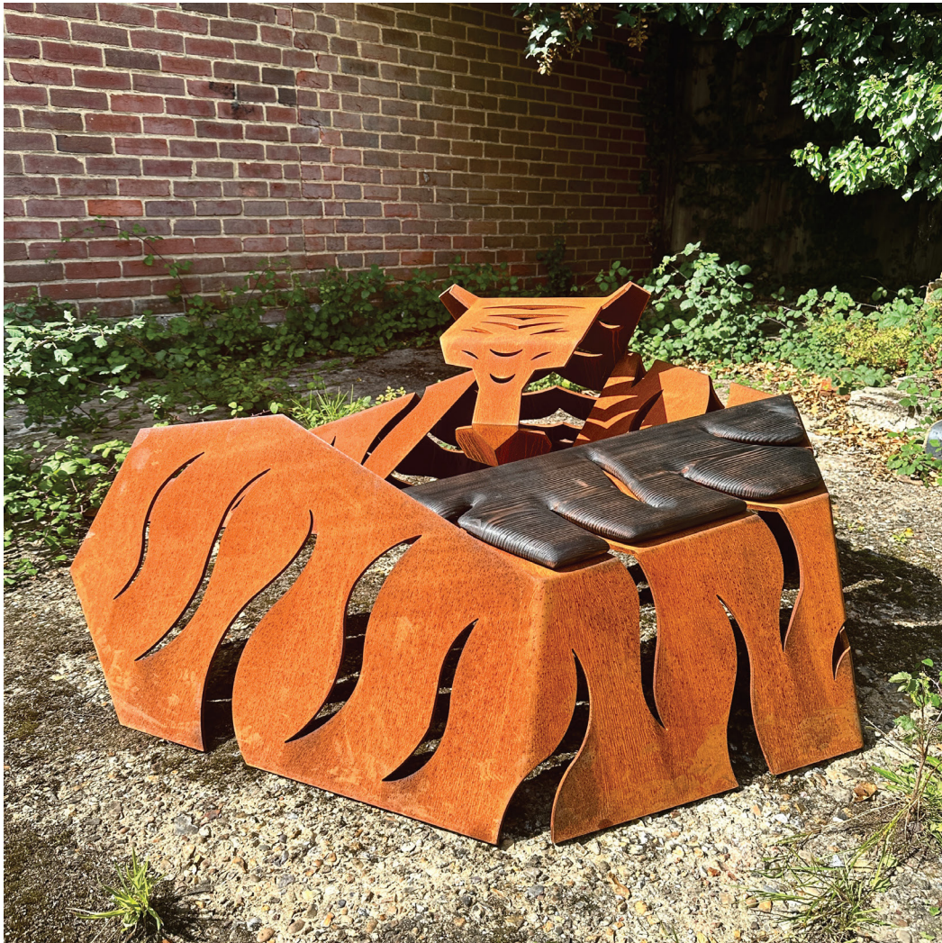
Tiger Seat 1 person seat 60 x 70 x 160 cm Corten steel with burnt douglas fir seat