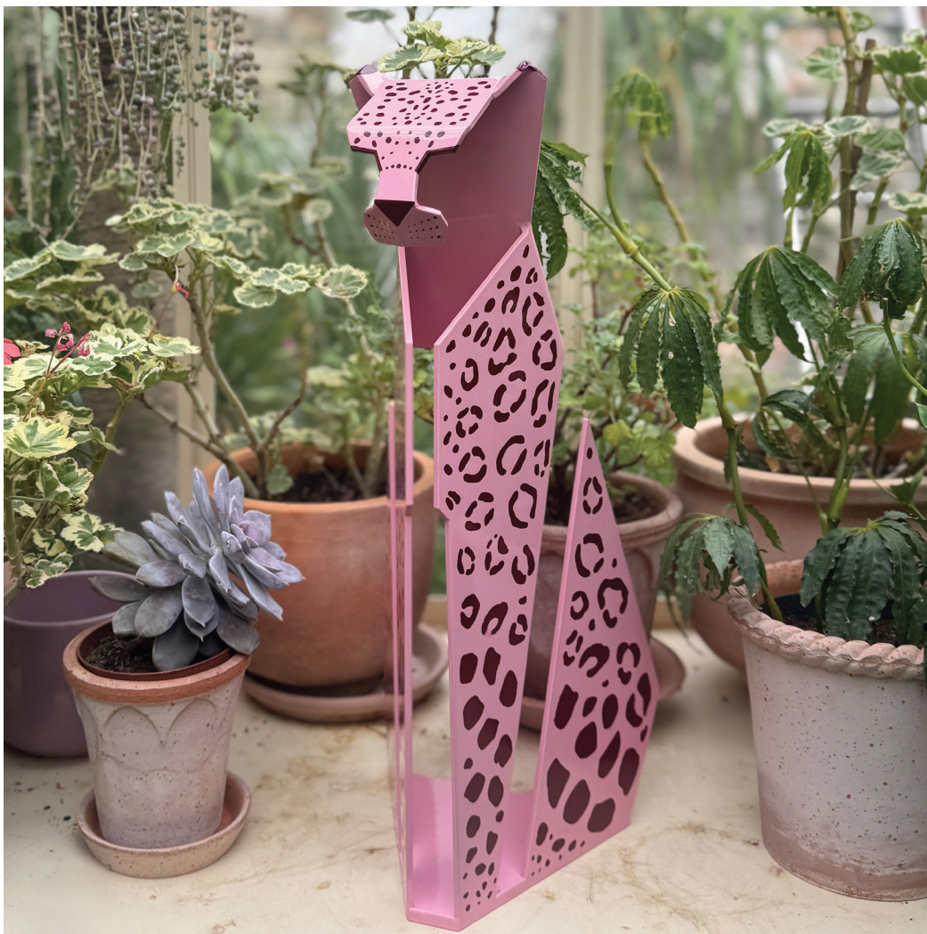
Leopard (Pink with Rose spots)