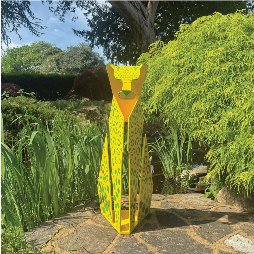
Leopard (Lemon with Lime spots)