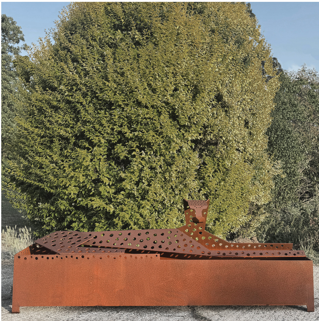
Lying Cheetah Light 72 x 40 x 200 cm Corten steel