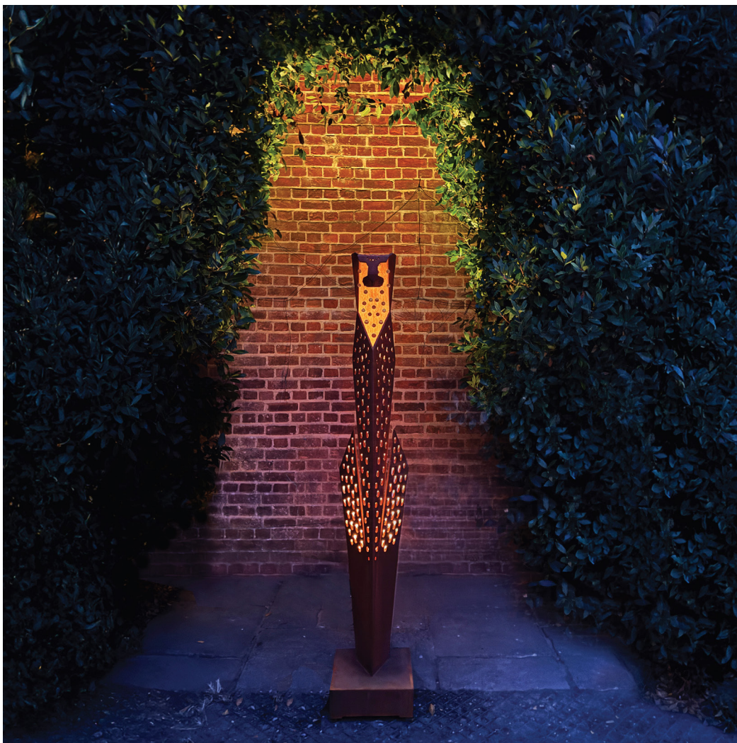
Cheetah Light 180 x 42 x 36 cm Corten steel with integrated lighting