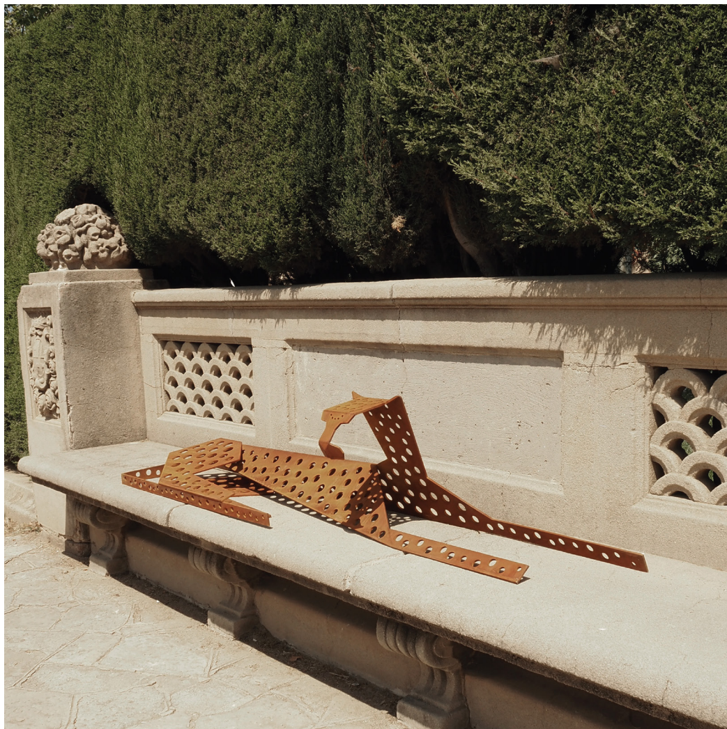
Lying Cheetah 45 x 45 x 205 cm Corten steel