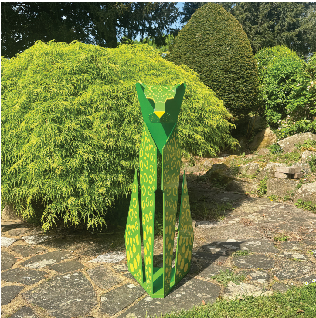
Leopard (Lime with Lemon spots)