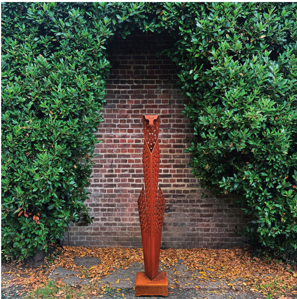
Cheetah Light 180 x 42 x 36 cm Corten steel with integrated lighting