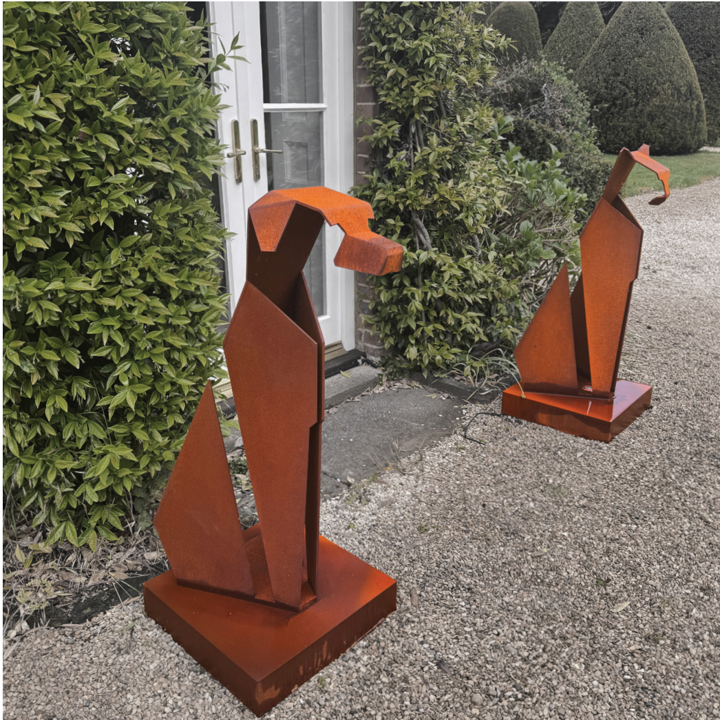
Dog Light & Cat Light 115 x 50 x 50 cm Corten steel with integrated light