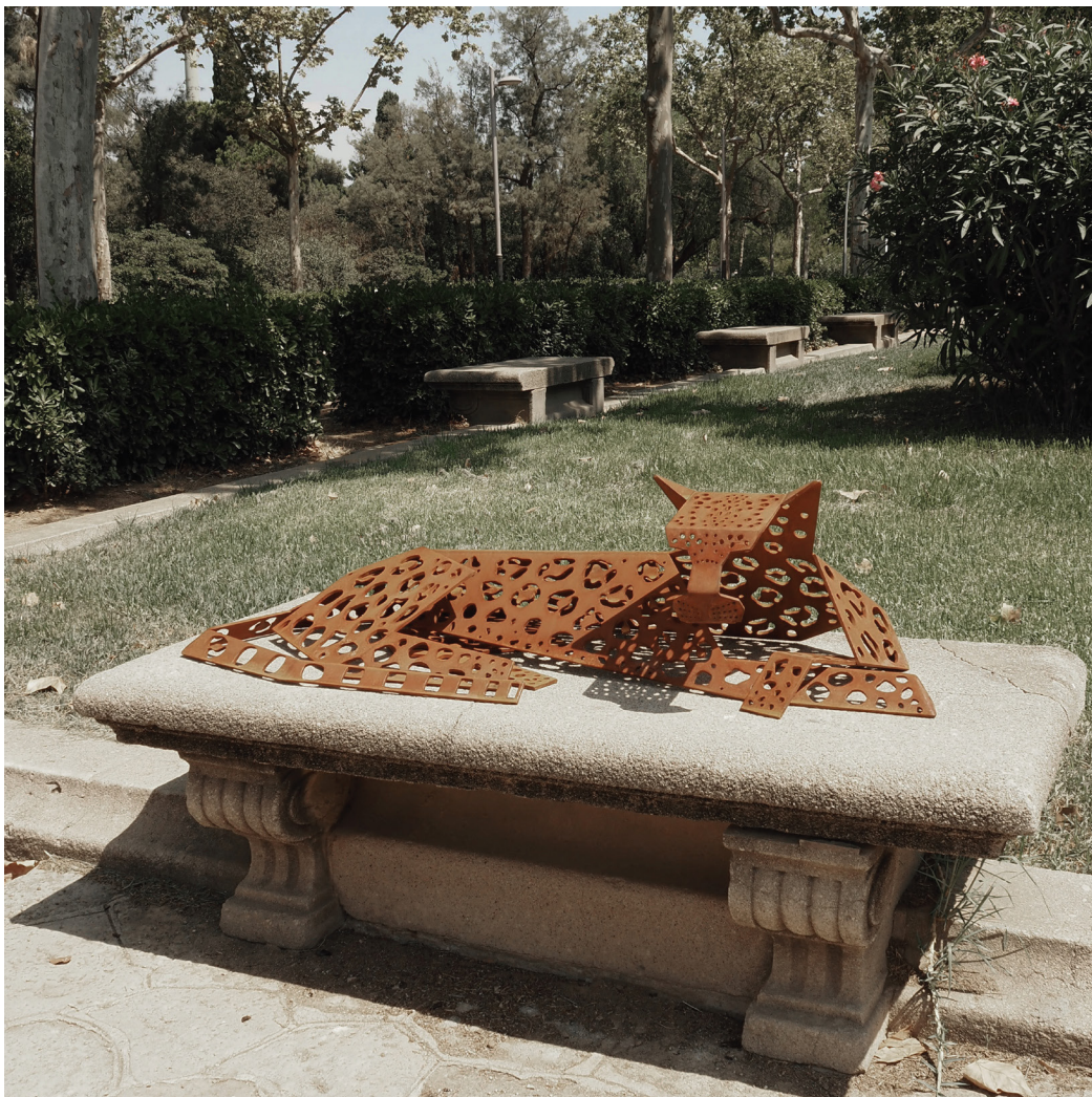
Lying Leopard 35 x 50 x 125 cm Corten steel