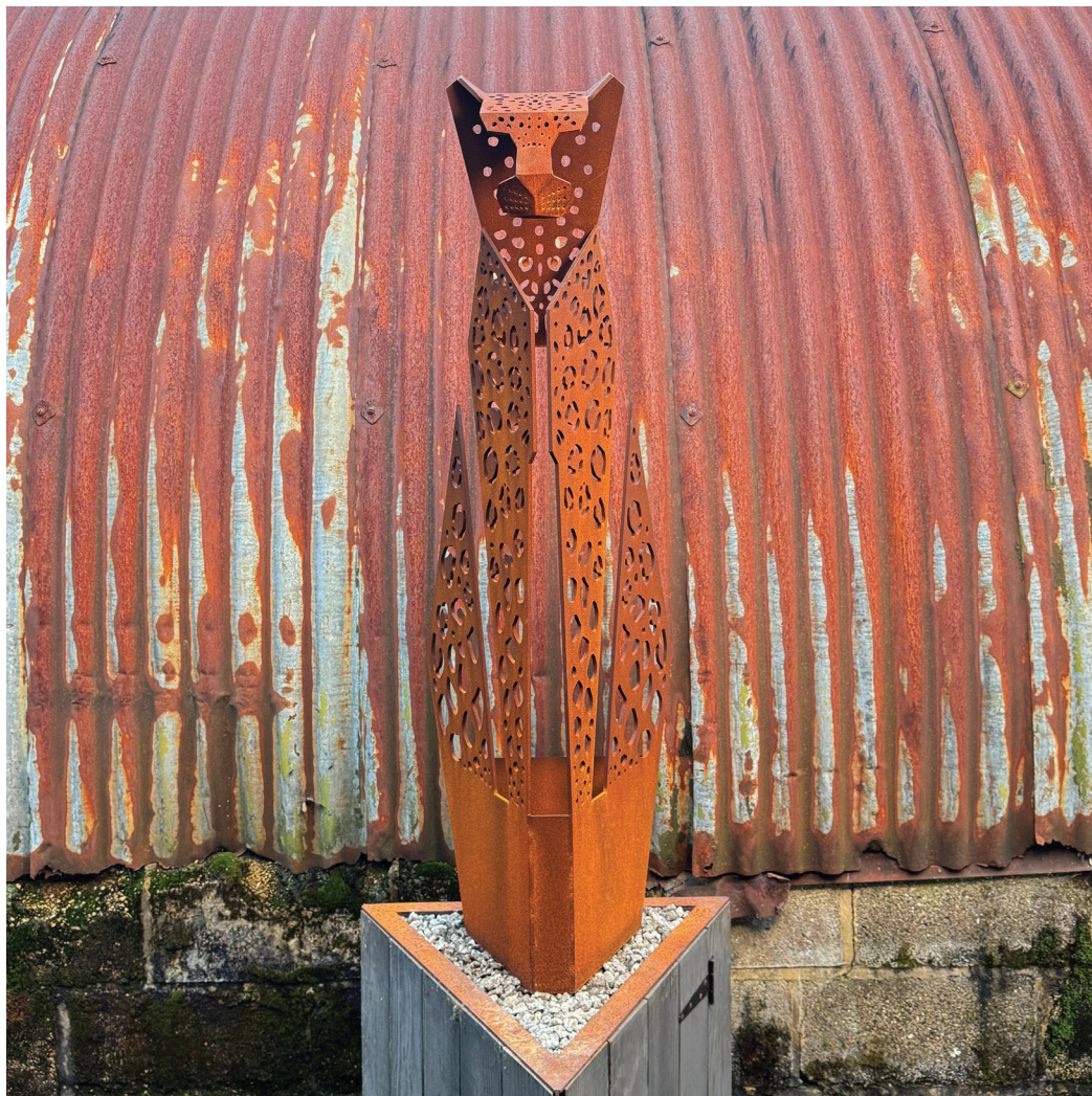
Leopard Light 125 x 45 x 55 cm Corten Steel with integrated lighting