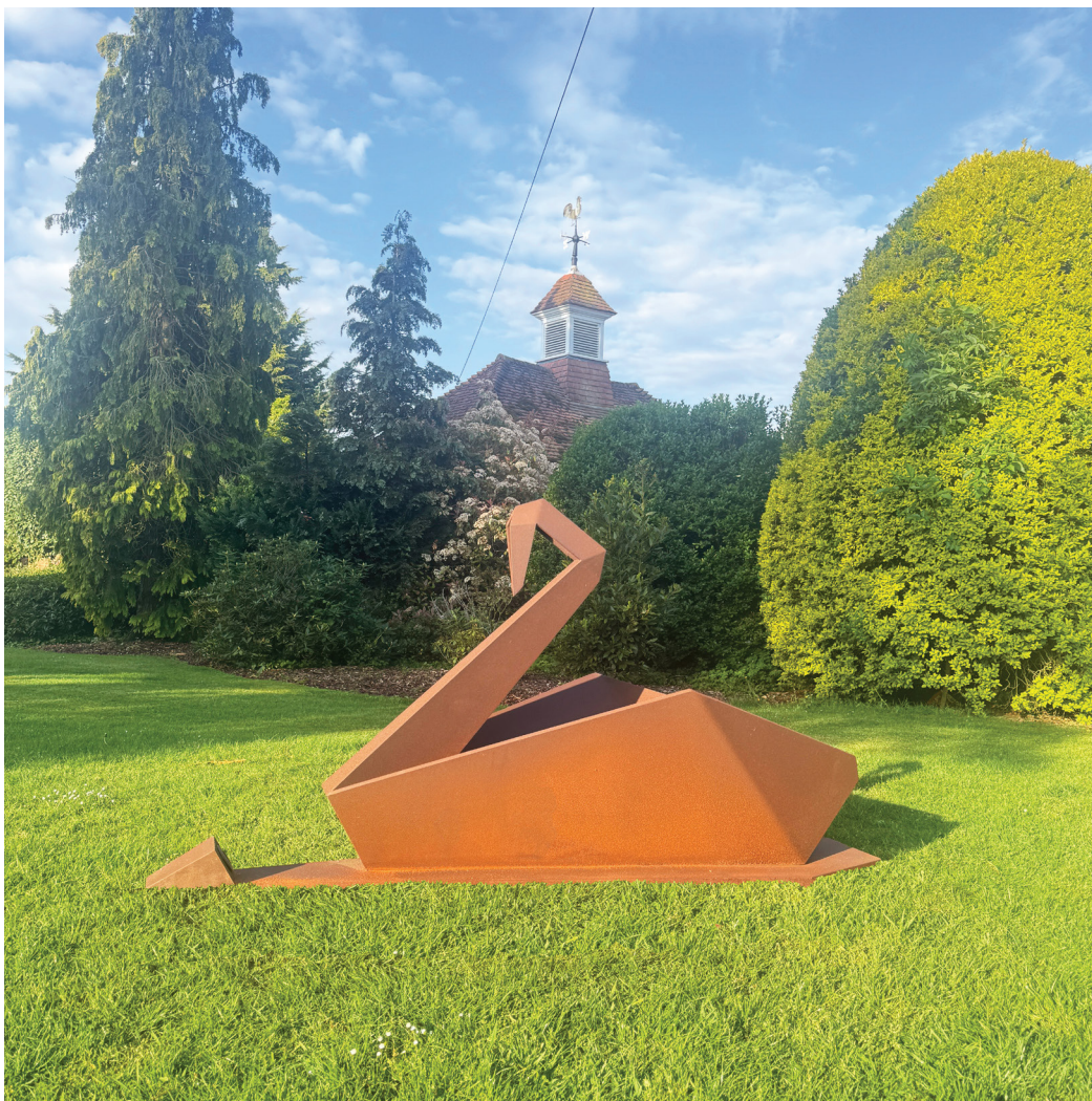
Swan 100 x 65 x 165 cm Corten steel