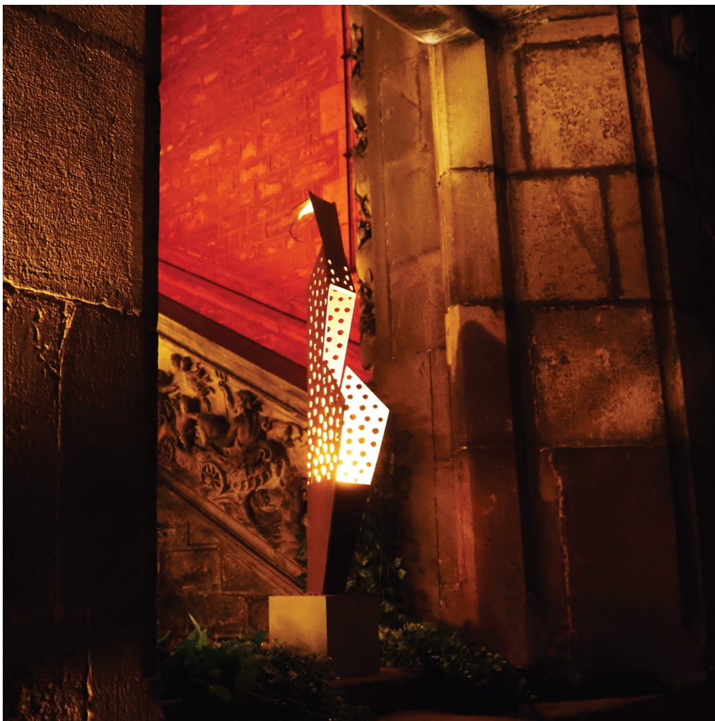
Cheetah Light (illuminated) Small 90 x 21 x 18 cm Corten steel with integrated lighting