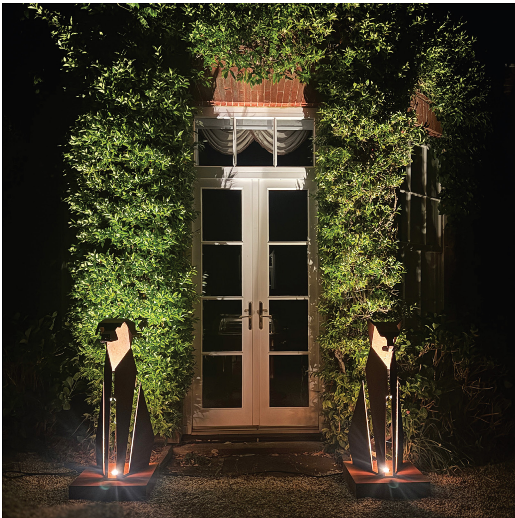
Dog Light & Cat Light (illuminated) 115 x 50 x 50 cm Corten steel with integrated light