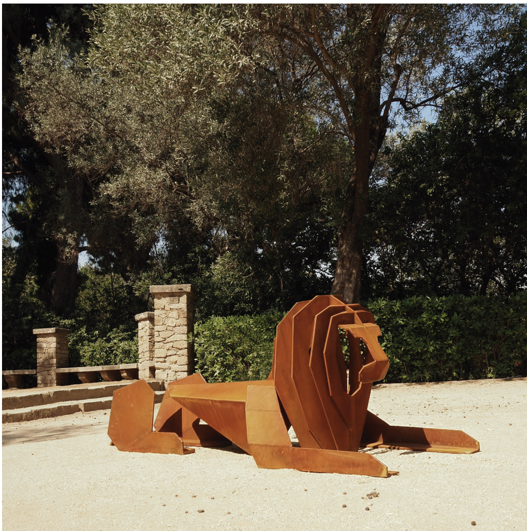
Lion 120 x 120 x 300 cm Corten Steel