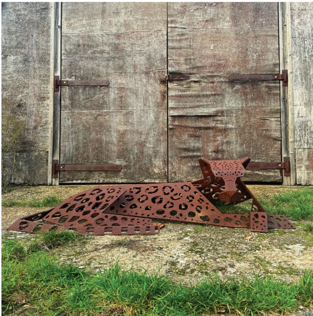
Lying Leopard Large 45 x 70 x 165 cm Corten steel