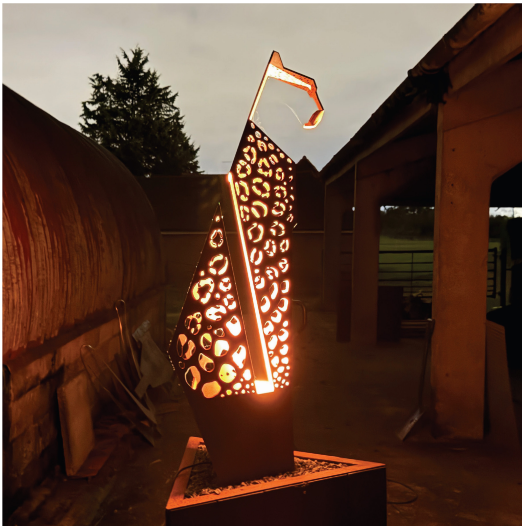
Leopard Light (illuminated) 125 x 45 x 55 cm Corten Steel with integrated lighting